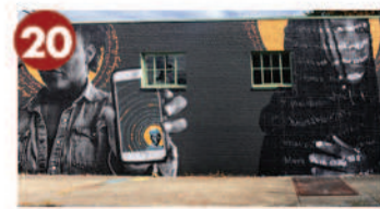
JETSONORAMA WITH JESS X. SNOW "AIN'T I A WOMAN?" MILNE FABRICATION FACTORY 72 FRANKLIN STREET 2015: THE OTHER

llyny.com | cargocollective.com/mataruda | nanookstreetart.com