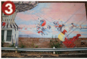
3 KIMBERLY KAE "BILANCIA" BIRCH BODY SPA (ALLEY) 73 CROWN STREET 2013: SCALE

Esopus-based artist Kimberly Kae envisioned two towering chair-o-plane rides that briefly intersect each other like an old set of scales. The seats of one ride are filled with young Muslim women in headscarves; one rider extends her arm and holds out a red ring, implying both a ring toss and the O of O+. The viewer's vantage point is from the seats of the other ride; the women's heads are not covered and the central flamenco-esque figure seems to challenge with her gaze as if to say, "You're next, try." The interaction is brief, but an opportunity to learn something of each other, to exchange and enrich our lives much in the same way the O+ Festival enriches lives through the exchange of art and healthcare.